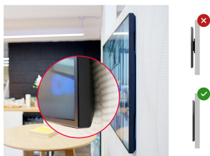
Zero-Gap Wall Mount

Designed to perform in continual, around the clock environments, the LH5070UHB can be installed and utilised in landscape and portrait orientation. The jaw dropping and best-in-class 30mm total depth (when used with the included proprietary brackets) will mean this display can be installed discretely and elegantly in all areas.